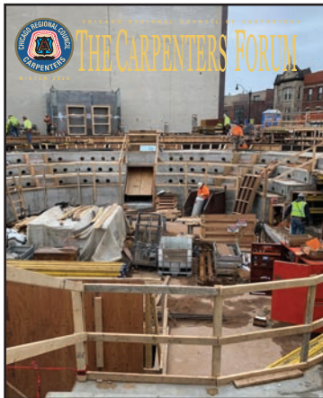
Steppenwolf Theatre 1642 N. Halsted Chicago, IL