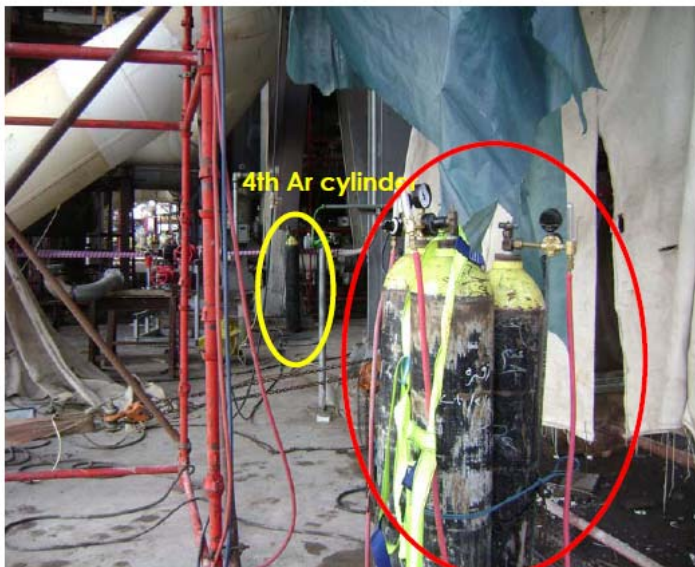
Positions of 4 Argon gas cylinders feeding inert chamber

On 16th of February 2010 at approximately 18:00hrs, two contractor welders made unauthorized entry into a confined space and were overcome by a low Oxygen, Argon rich atmosphere. The welders had just completed the root pass and hot pass welds, connecting a 36" pipe to a nozzle on a heat exchanger vessel. At completion of the welding, the pipefitters were requested to shutoff the Argon source which supplied the weld purge. Due to complexity of the bottle set-up, one bottle was inadvertently left open. Evidence indicates that one welder made entry into the vessel head to inspect the inside of the root pass weld, likely after pulling the purge dams using the external lanyard. When the dams were pulled the Argon hose still flowing and was drawn into the vessel head, increasing the Argon concentration of the atmosphere. When the second welder observed the first in physical distress, he entered to initiate the rescue, and he was also overcome but managed to call for help. A fitter responded and alerted the supervisor who took charge and initiated the rescue. Both welders were pronounced dead at the hospital at 18:50hrs.